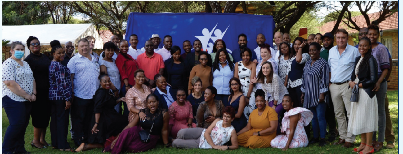
All smiles from the Union Hospital team as they celebrated victory.

This industry leading achievement is the result of a collaborative effort between Platinum Health (PH) staff at Union Hospital, together with the support of SBPM. This is the first site where PH offers medical services to achieve such vaccination success!